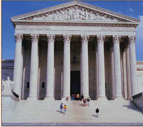
Last stop. In 2002, the Supreme Court rejected the death penalty (6–3) for mentally retarded persons.

don't see things the same way, because "they have trouble generating hypotheses of what might happen," says Baird, partly because they don't have access to the many experiences that adults do. The ability to do so emerges between 15 and 18 years of age, she theorizes in an upcoming issue of the Proceedings of the Royal Society of London .